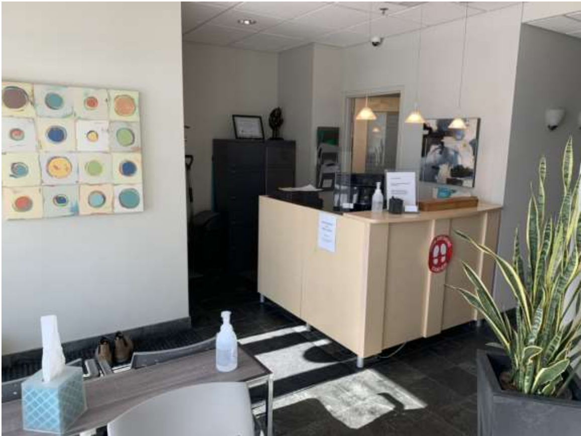
Front Desk and Business Office