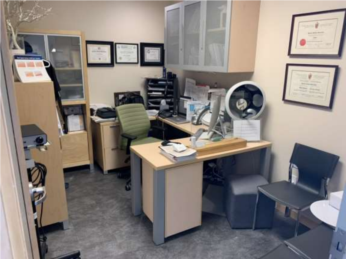
Consultation Office with Pastiche PhotoBooth