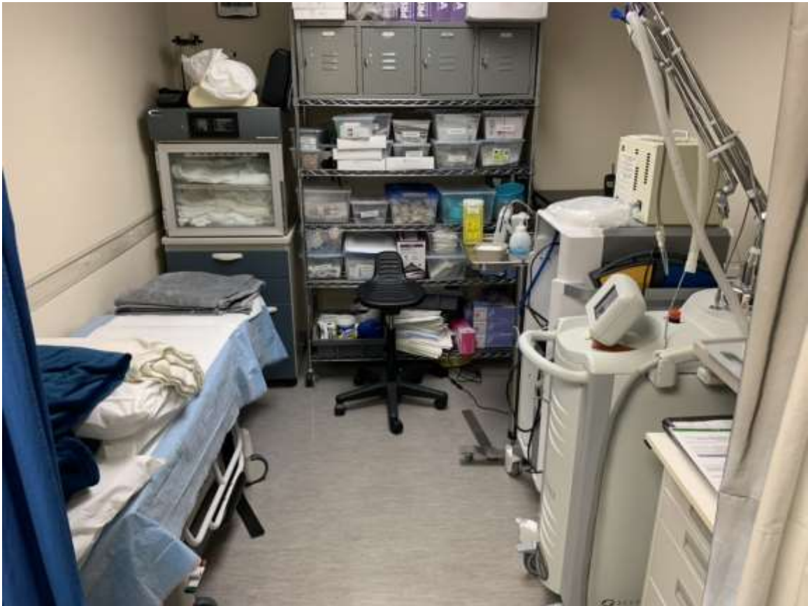
Post-OP recovery with Sciton Profile ErYAG /NdYAG laser and Renuvion on the right. Vented and laser treatment approved area.