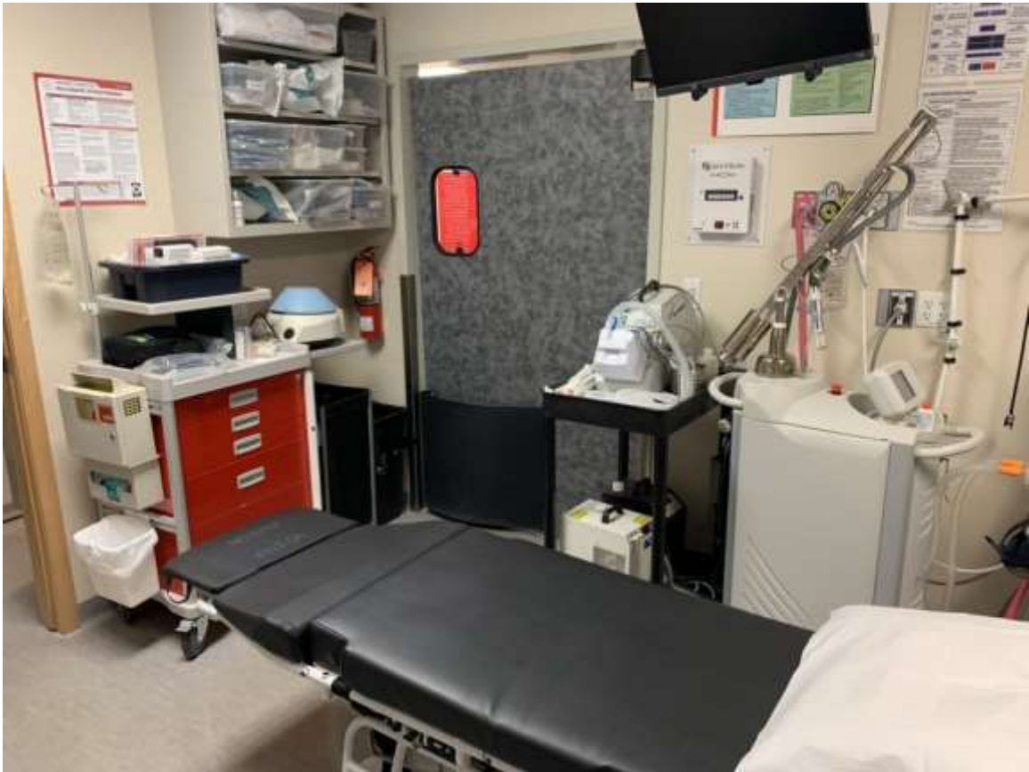
OR entrance and ProFractional ErYAG laser/BBL below ceiling monitor