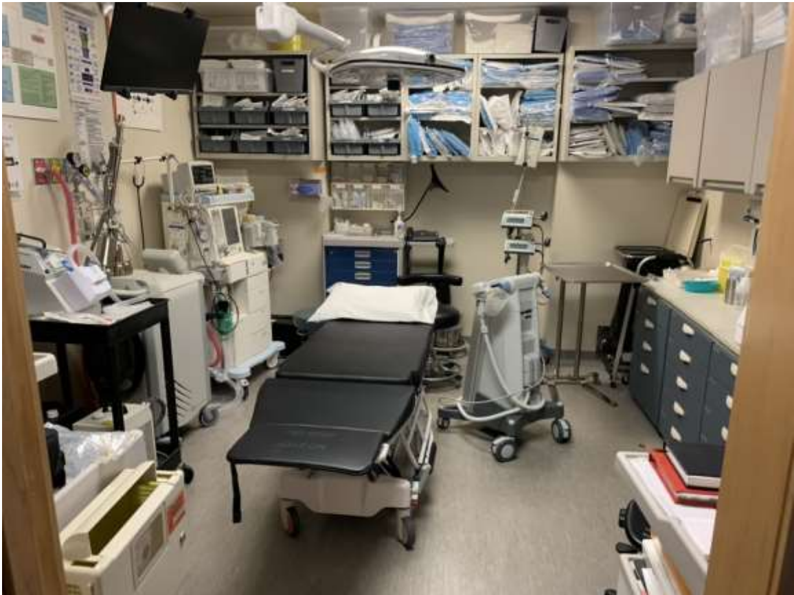
OR with Exilis on the right