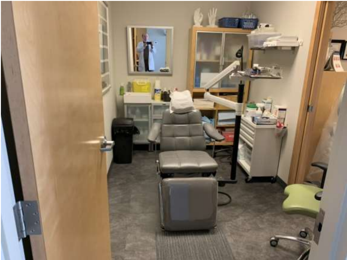
Examination and Minor Treatment Room