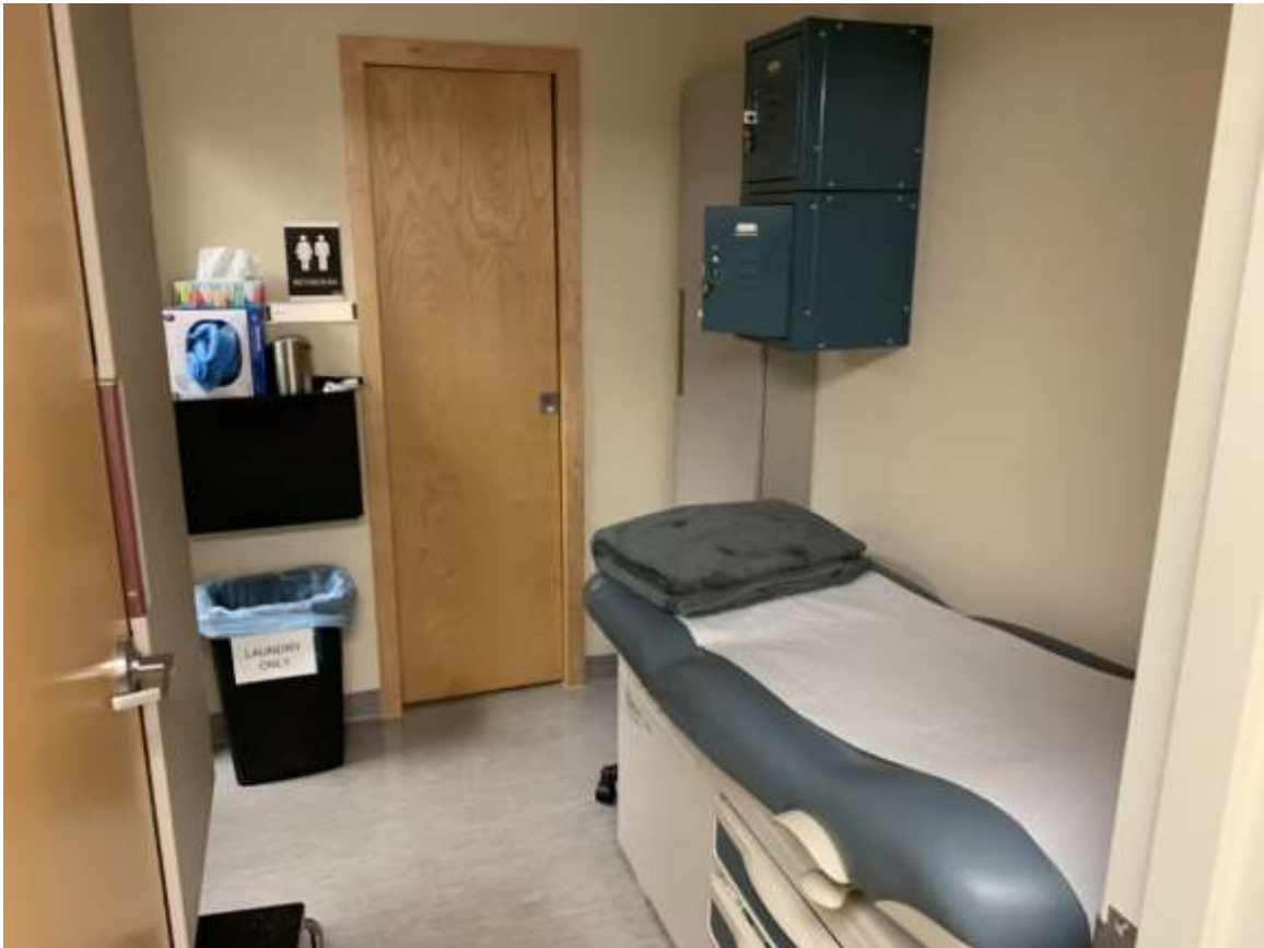
Pre-Op holding area/change room and adjacent lavatory