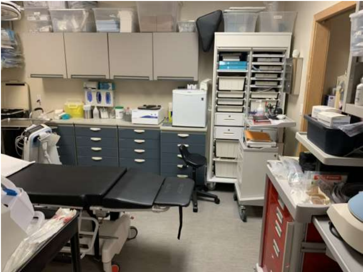
OR Crash cart, storage cabinets