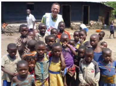
There are so many children everywhere in the Congo

THERE IS A STRONG INTEREST and considerable experience among CSPS members in providing humanitarian medical care and plastic surgeons have long been involved in overseas surgical missions. Operation Smile, Operation Rainbow, and many other plastic surgery organizations provide much needed plastic surgical care for cleft lip and palate, burns and other pathologies.